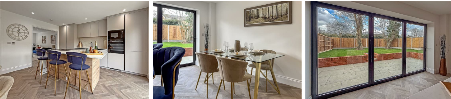
Ground Floor Approx. 536.6 sq. feet

MOVE IN NOW, PLOT FOUR, THE ROSE GARDENS.....Nestled in the charming village of Aston, Benington Road presents an exceptional opportunity to acquire these six stunning new build houses named The Rose Gardens. Developed by the esteemed Queenswood Homes, these properties boasts a selection of bedrooms and sizes, all with thoughtfully designed living spaces, perfect for modern families. Aston is renowned for its picturesque village atmosphere, offering a delightful blend of village and country lifestyle. Residents can enjoy the tranquillity of rural living while being conveniently located near essential amenities and transport links. These new build homes are not just a property; it is a lifestyle choice, ideal for those seeking a peaceful yet vibrant community. With a selection of styles and bedroom configurations available, this home can be tailored to suit your personal preferences. Whether you are a growing family or looking to downsize, these properties offers the perfect canvas to create your dream homes. Do not miss the chance to secure these brand new residences in one of the most sought-after locations. Embrace the opportunity to live in a beautifully crafted home that combines modern living with the charm of village life.